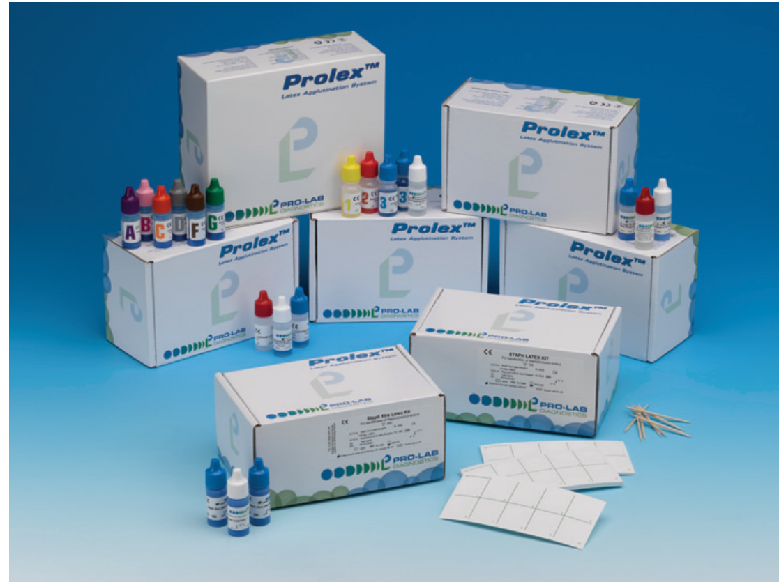
The current Prolex™ line-up