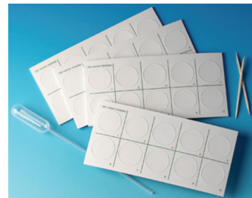
New Agglutination Card Design

An innovative kit offering a rapid, sensitive method to distinguish Staphylococcus aureus which possess coagulase (Clumping factor) and/or protein A, from other species of staphylococci. Prolex™ Staph gives rapid clear results within 20 seconds using blue latex particles against a white background.